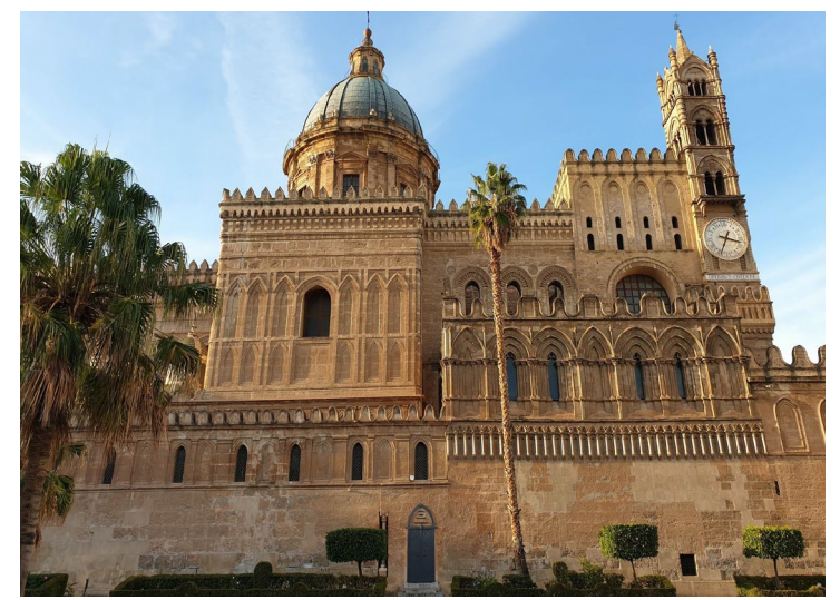
Starting Time: 9:00 or 9:30 am